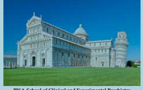
PISA-School of Clinical and Experimental Psychiatry Institute for Improving Neuroscientific Knowledge