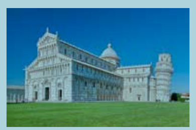
PISA-School of Clinical and Experimental Psychiatry Institute for Improving Neuroscientific Knowledge

To register to the conference, please visit http://iscdelisio.org/eventi-e-corsi/